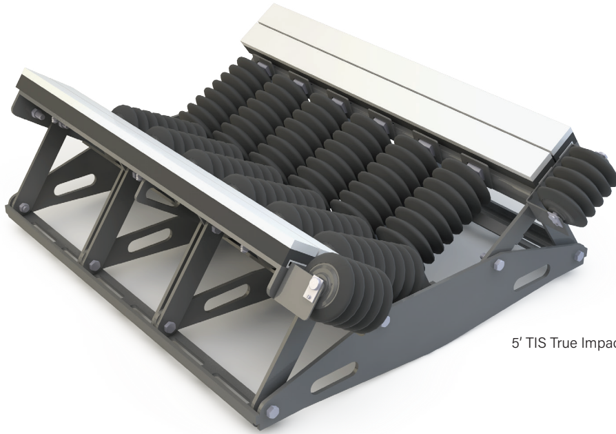
5' TIS True Impact System

PPI True Impact System (TIS) solves the problem of sealing the skirt boards and the high impact upon the belt. By utilizing its proven impact rolls, along with center support system that is cushioned against the frame, it gives the TIS its double action dampening system. This rugged 5' bed is made from welded steel and fits D6 and E7 rolls. While the rolls are D6 or E7, it does come in a low profile version (TISL) that will line up with C5/D5 or an E6. The slider rails come with 1/2" thick Ultra-high-molecular-weight (UHMW). This product is also available as a Channel Impact System (CIS).