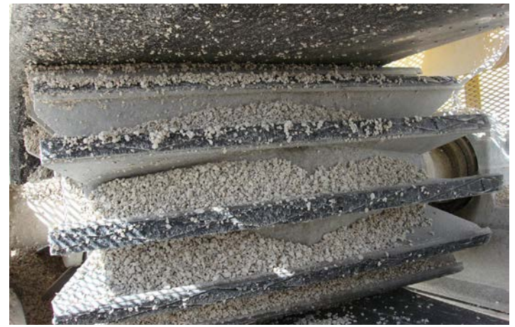
Figure 4 – Wing pulley recycled material.

The material will build up till it plugs up the pulley, or it may work its way to the end of the pulley where the material can get trapped between the end of the wings and the framework, resulting in bent wings, as shown in Figure 5. As you will notice, the wings are bent in one direction, backwards, i.e. opposite the direction of rotation.