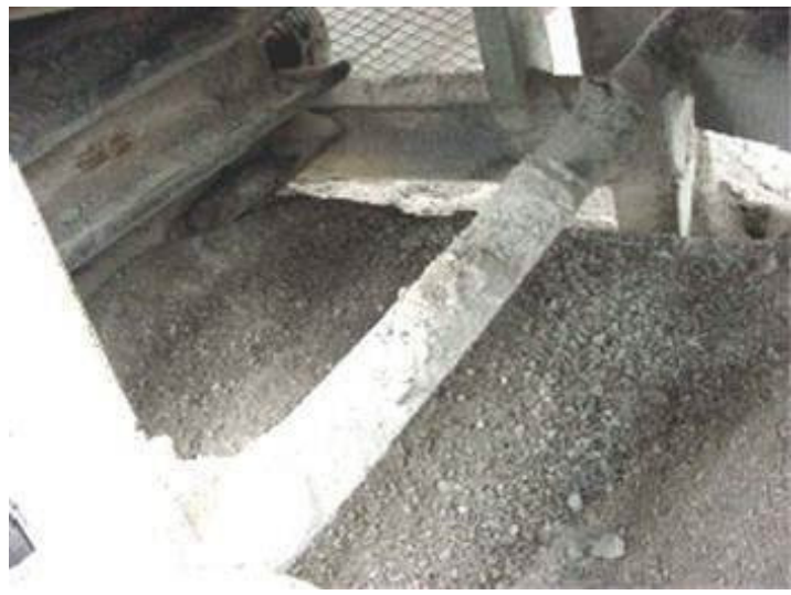
Figure 3 – Wing pulley build up at the tail.

As the material is thrown back onto the belt, it will be pulled into the pulley again and again. If more material falls onto the return side of the belt, it will add to the material being "recycled" by the tail pulley, as seen in Figure 3 and 4.