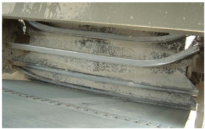
Figure 5 – Tail pulley with bent wings.

Since material doesn't fall and hit the gussets, what good are gussets? They fill in the gap between wings bracing one wing against another. However, the shape and position of the gusset is based upon the material falling and hitting the gusset, not the bracing the wings! A better design would have the brace perpendicular to the wing, and at the center, not the ends where it could block material from exiting the pulley. For example; a steel disc at the center to tie the wings to each other.