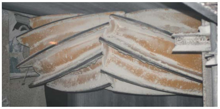
Figure 7 – Herringbone wing in underground quarry.

Herringbone Wing pulleys were developed in 2010 and have been used in applications involving coal, potash, limestone, petroleum coke, grain, etc. (as shown in Figure 7 and 8) and have performed well in all. They have reduced maintenance, vibration, noise, and improved tracking over pulleys they have replaced. Analysis has shown that they are stronger than the wings they replace, and have been used when conventional wings will not handle the load.