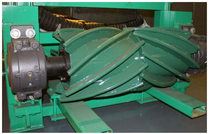
Figure 8 – Herringbone Wing in Load Section Tail for Coal Mine.